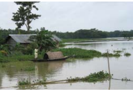
Flooding in Bangladesh

Kay Weller (Geography) received a Fulbright-Hays award to develop curriculum about natural hazards in Bangladesh. She and her team spent four weeks there meeting with universities and schools and were there to experience the worst flooding in a decade.