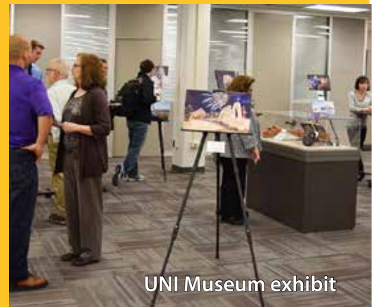
UNI Museum exhibit