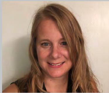
Stacye Lyman Outstanding Graduate Secretary Award