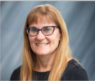
Helen Harton Outstanding Graduate Coordinator Award