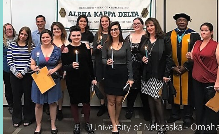
University of Nebraska - Omaha

Chapters may apply additional criteria for both undergraduate and graduate students. Sociology faculty members and those employed as sociologists may be inducted through their institution.