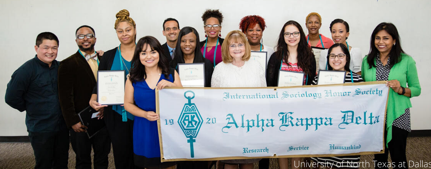
University of North Texas at Dallas