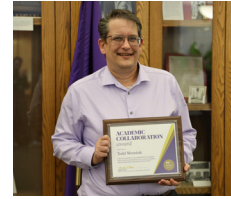
Todd Mensink Academic Collaboration Award