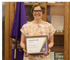
Disa Cornish North Star Award