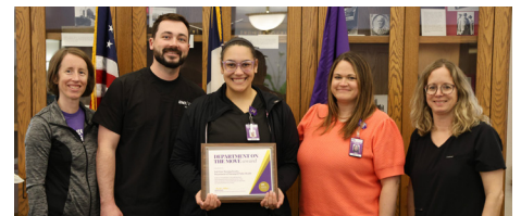
Full-Time Nursing Faculty, Department of Nursing & Public Health Department on the Move Award