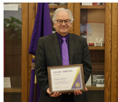
Gregory Bruess Study Abroad Award