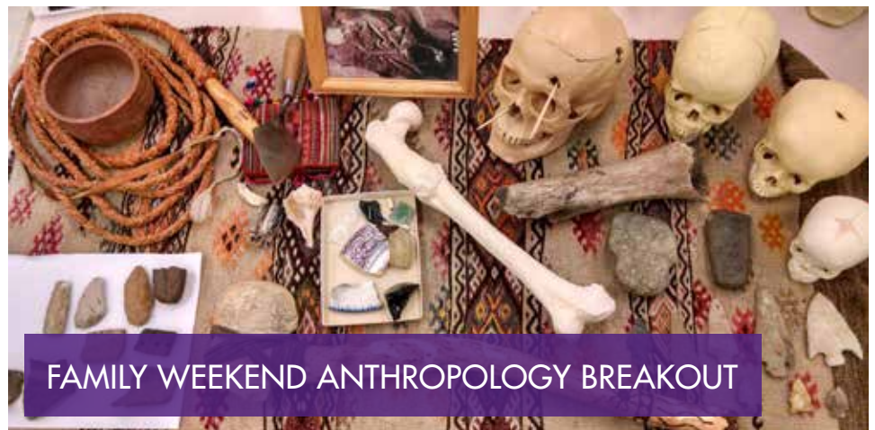
FAMILY WEEKEND ANTHROPOLOGY BREAKOUT