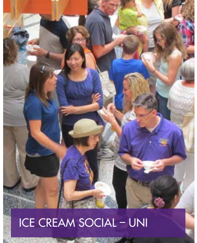
ICE CREAM SOCIAL – UNI