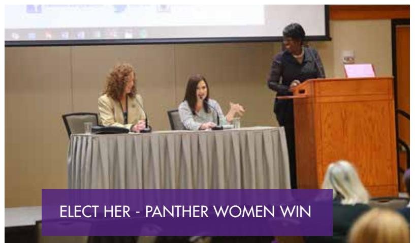
ELECT HER - PANTHER WOMEN WIN