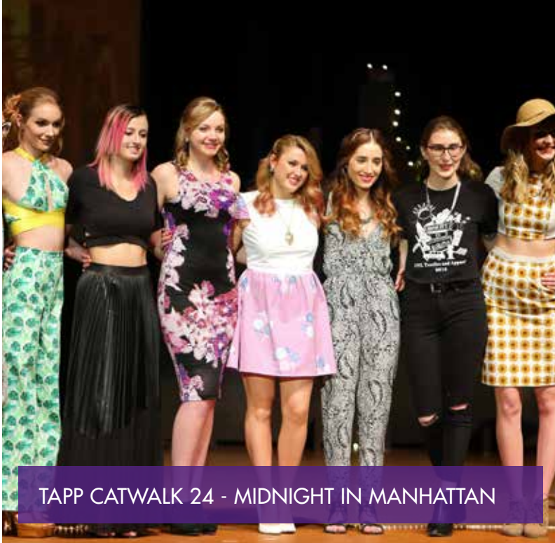
TAPP CATWALK 24 - MIDNIGHT IN MANHATTAN

Reminder: Please share the good work happening in CSBS so we can promote your program along with our college to a broader audience. An email link is provided in CSBS Weekly for your convenience.