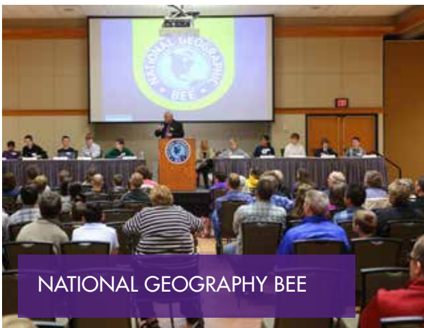
NATIONAL GEOGRAPHY BEE