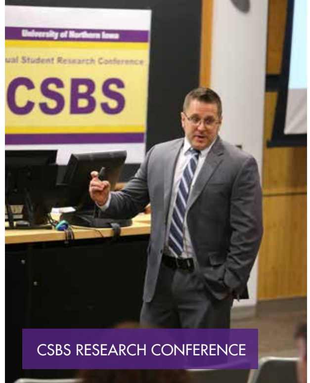
CSBS RESEARCH CONFERENCE