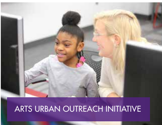
ARTS URBAN OUTREACH INITIATIVE