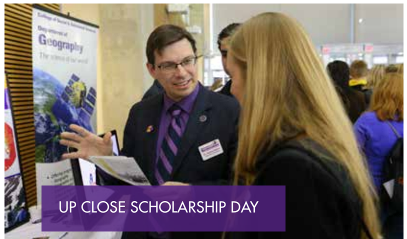
UP CLOSE SCHOLARSHIP DAY